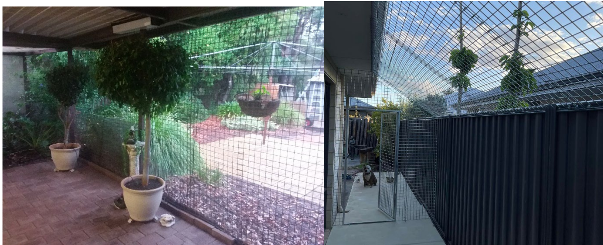
Tower mesh enclosures

You may want to consider enclosing your existing patio or the roof of your side alley enclosure with open weld mesh as shown below. It is best to check with your local council first.