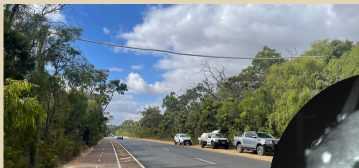
Possum rope bridge installed in Busselton to connect canopies and evidence of its use.

If you would like to partner on a project to benefit threatened species, please open a discussion by emailing: admin@southwestnrm.org.au