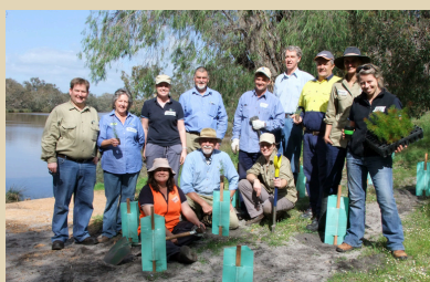
Community tree planting event to restore habitat.

Nowadays they are found in only about 10% of their original range.